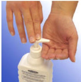
Applying Glo-germ cream for hand washing

To find out if a cleaning procedure is correct, or to train in correct procedures, simply artificially "contaminate" the hands, medical components or surface with the cream or powder and then ask your operators to wash or clean them as they would normally. Cast the UV light over the "clean" area and any remaining particles of artificial contamination will glow. The presence of artificial contamination indicates that the cleaning procedure has not been 100% effective.